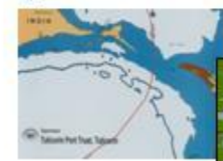
Sethusamudram Ship Channel