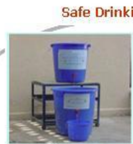
Safe Drinking water