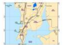
Mumbai Sewage Disposal Project